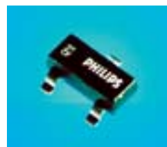
SOT-23, H=1.1, W=3.0, D=1.4