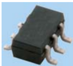
SOT-457, H=1.1, W=3.1, D=1.7