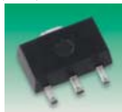
SOT-89, H=1.6, W=4.6, D=2.6